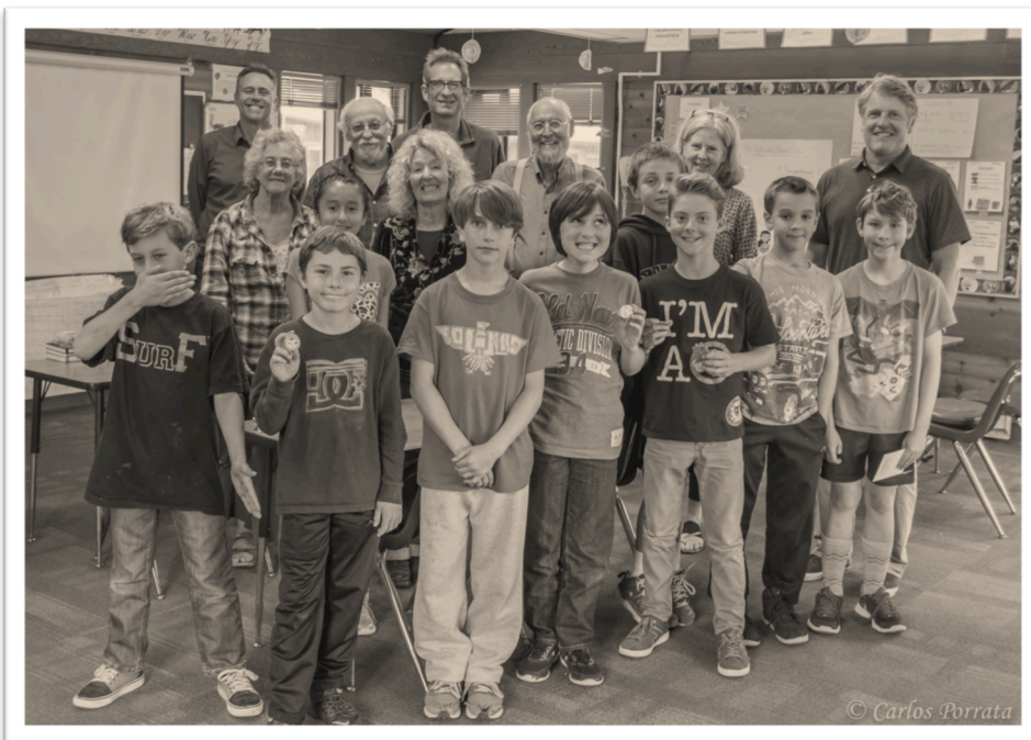
Giving Through Youth: Bolinas – Stinson 4th Grade class, Summer 2016.

BUILDING NONPROFITS CAPABILITIES: This ConFab and others respond to the critical need to upgrade fundraising capacities of nonprofits . It's hard work, and not always comfortable for board members or staff to ask for money. But supporting The Good Efforts can be a pleasure and a reward for donors (witness how happy it makes our Giving Through Youth students!).