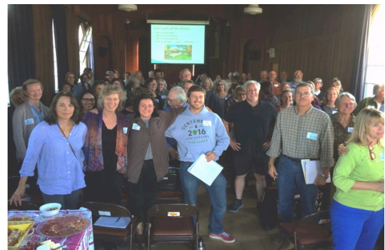
Happy participants at the September ConFab

These free skill-building workshops – our "ConFabs" – are one of the valuable services the WMF offers to our non-profit community.