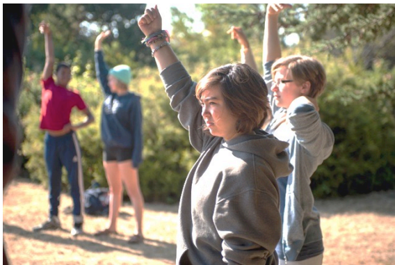
Power of Hope Camp at Commonweal in Bolinas

“Our youth want access to more opportunities in West Marin – not necessarily over the hill. The West Marin Fund helps us do our work by connecting our regional Youth Centers and providing paid internships locally.”