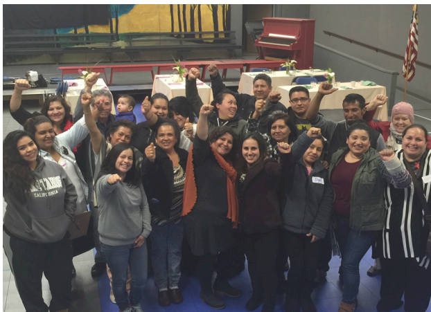
Abriendo Caminos – West Marin's Latino Empowerment project